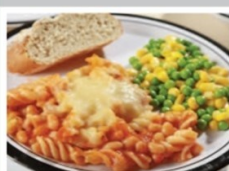
Cheesy Bean Pasta served with Garlic & Herb Bread and Seasonal Vegetables