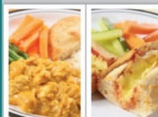
Chicken Korma served with Rice, Naan Bread & Seasonal Vegetable or Hot Pizza Baguette served with Carrot & Cucumber Sticks