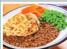
Cottage Pie served with Seasonal Vegetables