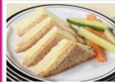
Deli Choice of Breads with a Selection of Fillings served with a Side Salad