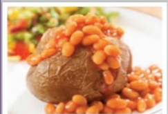
Jacket Potato with a Selection of Fillings served with a Side Salad