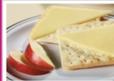
Cheese & Crackers