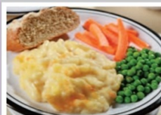
Mac 'n' Cheese served with Garlic & Herb Bread and Seasonal Vegetables