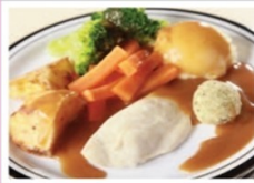
Roast Chicken served with Roast/Mashed Potatoes, Seasonal Vegetables & Gravy