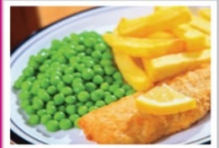
Battered Fish (MSC) served with Chips & Peas or Baked Beans

VEGETARIAN VERSION OF THE ABOVE AVAILABLE DAILY