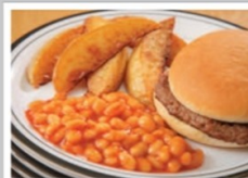
Beef Burger served in a Bun with Potato Wedges & Seasonal Vegetables or Baked Beans