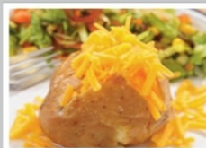
Jacket Potato with a Selection of Fillings served with a Side Salad

VEGETARIAN VERSION OF THE ABOVE AVAILABLE DAILY