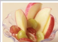
Apple & Grape Pot