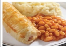
Homemade Sausage Roll served with Mashed Potato & Baked Beans