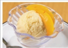
Ice Cream & Fruit