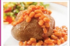
Jacket Potato with a Selection of Fillings served with a Side Salad