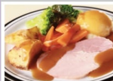
Honey Roast Gammon served with Roast/Mashed Potatoes, Seasonal Vegetables & Gravy