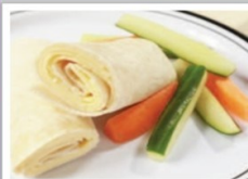
Deli Choice of Breads with a Selection of Fillings served with a Side Salad