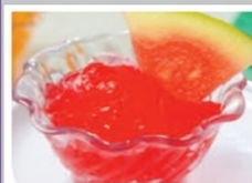
Jelly & Fruit