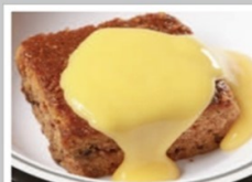
Sticky Toffee Pudding served with Custard