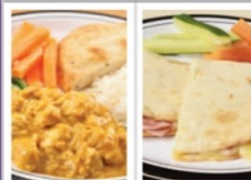
Chicken Korma served with Rice, Naan Bread & Seasonal Vegetable or Hot Cheese & Ham Wrap served with Carrot & Cucumber Sticks