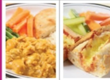
Chicken Korma served with Rice, Naan Bread & Seasonal Vegetable or Hot Pizza Baguette served with Carrot & Cucumber Sticks