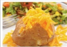
Jacket Potato with a Selection of Fillings served with a Side Salad

VEGETARIAN VERSION OF THE ABOVE AVAILABLE DAILY