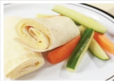
Deli Choice of Breads with a Selection of Fillings served with a Side Salad