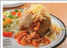
Jacket Potato with a Selection of Fillings served with a Side Salad