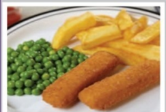
Fish Fingers served with Chips & Peas or Baked Beans

VEGETARIAN VERSION OF THE ABOVE AVAILABLE DAILY