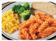
Tomato & Mascarpone Cheese Pasta served with Garlic & Herb Bread and Seasonal Vegetables