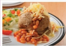
Jacket Potato with a Selection of Fillings served with a Side Salad