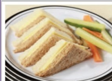
Deli Choice of Breads with a Selection of Fillings served with a Side Salad